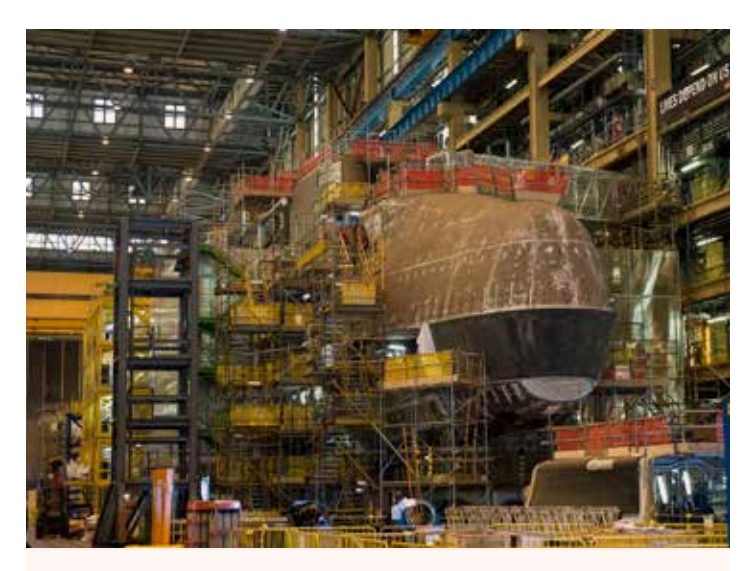
Astute Class submarine Audacious under construction

Trident), the UK has title to 58 missiles. Aside from those currently deployed, the missiles are held in a communal pool at the US Strategic Weapons facility at King's Bay, Georgia, USA. Maintenance and in-service support of the missiles is undertaken at periodic intervals at King's Bay, normally after a submarine has been through refit.<sup>9</sup>