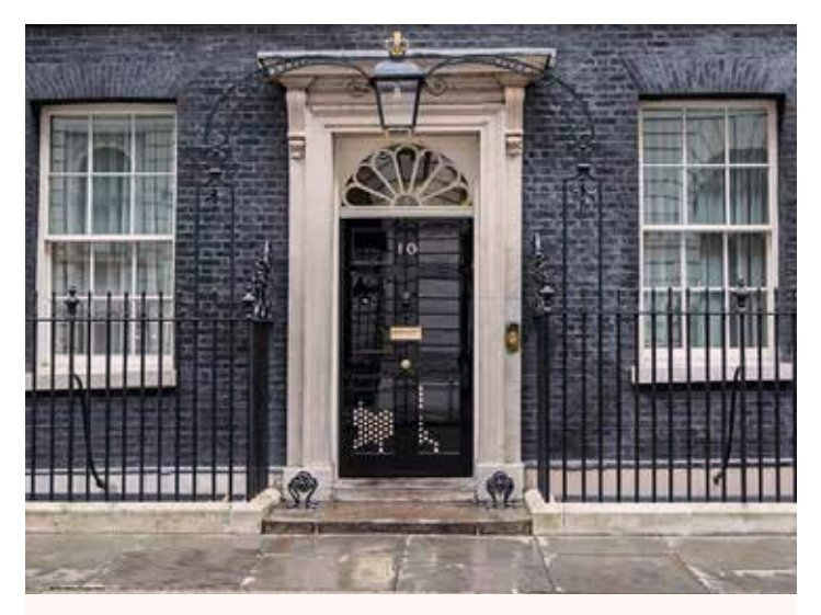
The NAO estimate the Government need to bridge a £2.9 bn "affordability gap" with Dreadnought.

continuing design work, purchasing materials and long lead items and investing in facilities at Barrow.53 In March 2018, contracts worth £960 million for the second phase of production were agreed.54 The number of investment stages is undefined and will be clarified as the build progresses.55