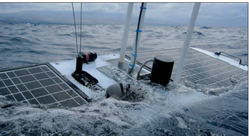
Wave Glider surf board with solar power and communications, attached to drone below the surface

Gliders are ideal for research tasks requiring long endurance or hazardous conditions. Gliders helped track the Deepwater Horizon oil spill, and measured radiation levels around Fukushima.