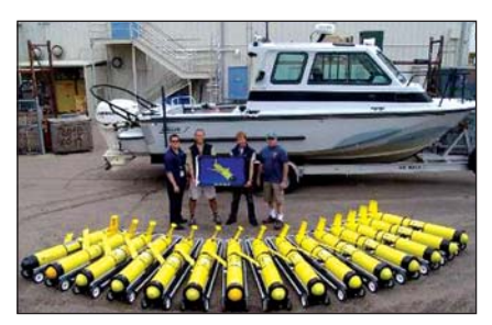
An array of Teledyne Gliders

There are three commercial varieties, all from the US and all with the same winged-torpedo body shape – iRobot's Sea Glider, Teledyne Webb's Slocum Glider, and Bluefin's Spray Glider. Endurance is currently a matter of months, though Teledyne Webb have also designed <u>a version with a thermal</u> <u>engine</u> which can extract energy from the temperature difference at different depths and continue indefinitely.<sup>26</sup>