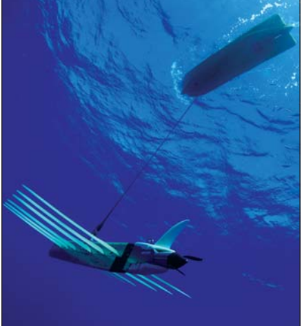
Wave Glider with powerful sensors, and with surface board providing continuous power and communications

But the laws of physics – not to say common sense – suggest that a boat five hundred feet long and weighing sixteen thousand tons, carrying an operational nuclear reactor, cannot be made to disappear utterly at close range. Small unmanned platforms can carry many types of sensors