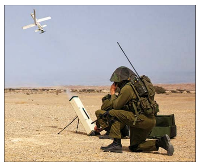
Israeli soldier launches Hero attack drone

It is hard to overstate how rapidly electronics are evolving compared to the usual extended generation time of military hardware. Perhaps one of the most eye-opening facts is that the US's state-of the-art F-22 Raptor aircraft has data processing <u>based on 1990's-era Intel 80960</u> <u>processors.</u><sup>7</sup>