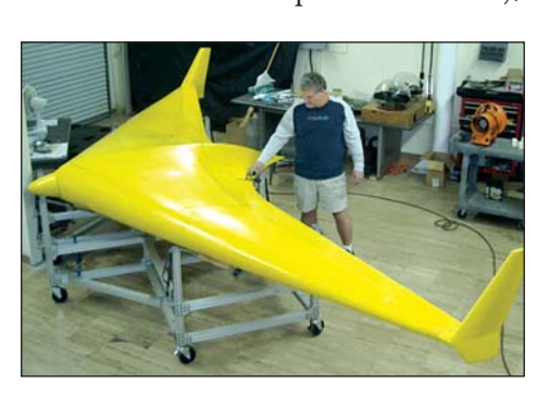
An X-ray drone, predecessor to the Z-Ray

<u>Littoral Battlespace Sensing-Glider</u> (LBS-G) program will involve up to a hundred and fifty Teledyne Webb gliders.<sup>30</sup> This is concerned with measuring water conditions as they affect sound and light. Layers of water of different temperatures affect the sonar reflection and transmission, and the cloudiness of the water determines how great a depth can be seen through (and at what distance laser sensors and communications will work). LBS-G provides a means to measure these and other factors remotely.